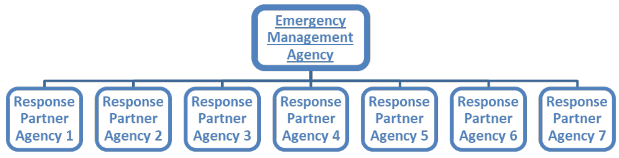
Figure 1.1 Organizational structure during response

Response and recovery are different, but closely linked. When disaster strikes, response takes the spotlight. Emergency responders provide the most urgent and immediate needs to the impacted disaster area, including food, water, shelter, and medical attention. Response is top-down, directed operation due to immediacy of life safety operations.