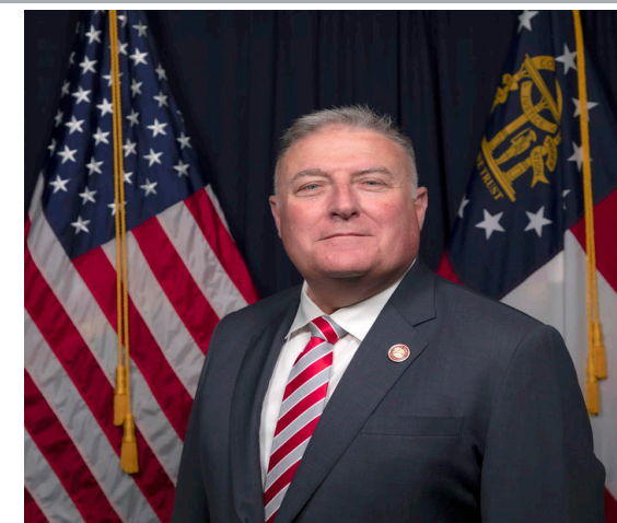
COMMISSIONER JOHN F. KING